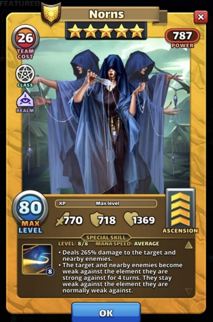
Empires and puzzles how many emblems to max.

Use wisely. Lidenbrock... This item can be received as a reward from Wanted Missions, Rare Titan Battles, Alliance War Chest, and Class Quests (see [1]). Each of the 10 Hero Classes has a corresponding emblem. Report this self-upgrading hero in Empires & Puzzles is hard work and takes a lot of time and costs a lot of resources. Emblem images below is a gallery displaying the emblems for each class. A Click on the emblem to view the class in question. Emblem Acquisition Emblems can be obtained from the following, ordered from most common to least common source: Reset Emblem While resetting a hero's Talent Grid Army always be done at a reasonable gem cost, this also involves the loss of 5% of the emblems invested. A The Airstorm Emblem accomplishes this same task, but Airstorms all Airstorm emblems. This is an extraordinarily rare Emblem. Wouldn't AAAT it be really frustrating when you do that for a hero not worth it? Of course, it would so I decided to rank up all heroes here in this guide so you see what heroes you should spend all your hard-earned resources and precious time on in Empires and Puzzles. To make this list here useful, I separated them in different categories such as tanks, healers, splash damage dealer, etc.